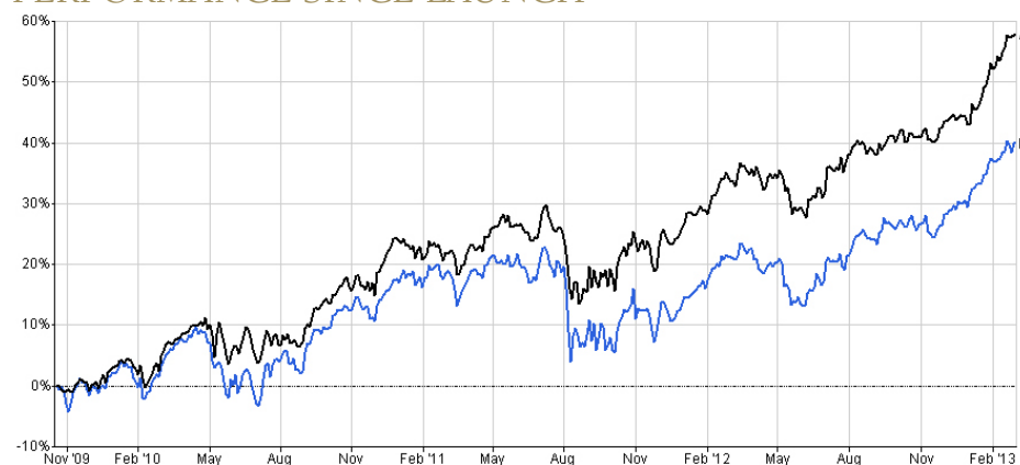
■ A - Wise Investments - Evenlode Income B Inc TR in GB (57.96%) ■ B - IMA UK Equity Income TR in GB (40.02%)

19/10/2009 - 01/03/2013 Data from FE 2013